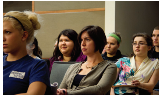
Ashton Kutcher as a guest speaker at the University of Iowa

If you want a “happy life,” Kutcher advised, focus on enriching the lives of others. The more happiness you put out into the world, the more joy will find its way back to you.